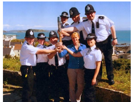
Commonwealth baton in the Bailiwick

The Commonwealth Baton came to the Bailiwick on its route to Glasgow and was transported to primary schools in Guernsey, Alderney, Sark and Herm and to sporting events around the Bailiwick during its three day visit. The Sports Commission were supported by the Neighbourhood Policing Team to ensure the baton's safety and smooth running of the events.