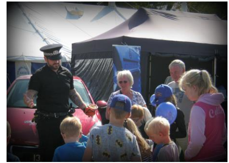
Police Officers at the North Show

Neighbourhood Policing Team officers attended the West and North Shows where they gave advice and promoted crime prevention and road safety.