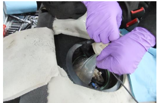
Drugs being removed from the fuel tank

A UK-registered vehicle was stopped by GBA officers having arrived by ferry. A search of the vehicle revealed approximately 54 grams of MDMA powder, 2 grams of herbal cannabis and 2,296 tablets containing class C controlled drugs in the fuel tank. The driver of the vehicle was arrested and three other non-local men were also arrested as part of the investigation, one of whom had arrived on the same ferry as a foot passenger. Three of the men received six years and six months imprisonment for the importation of MDMA, three years and six months for the importation of piperazine tablets (BZP, DBZP & TFMPP) and one month imprisonment for the importation of herbal cannabis to run concurrently. The fourth man received a £600 fine.