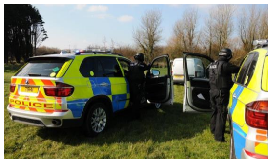
Police Tactical Firearms Unit

The Police Tactical Firearms Unit was granted a provisional licence from the College of Policing to operate as an approved police firearms training delivery centre. This was an important achievement and ensures that all police firearms officers and commander training is delivered in accordance with the national curriculum.