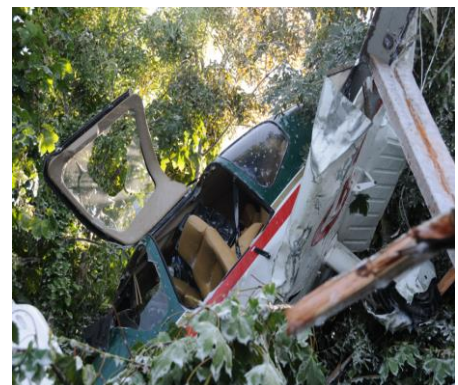
Light aircraft crash-landed

A private aircraft enroute from Guernsey to Norfolk crash landed shortly after take-off into a derelict green house at the rear of a property at Forest Road, Forest. Both individuals aboard survived. This critical incident saw Guernsey Police working in conjunction with all the blue light services, various States departments and voluntary organisations to ensure a safe and satisfactory conclusion ensuring minimum disruption to the community and environment.