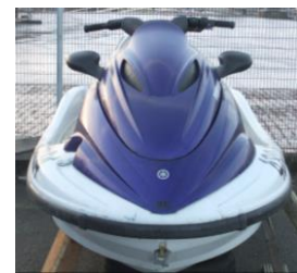
Jet-ski used in importation

Thousands of islanders gathered on North Beach for the Enough is Enough protest. Police officers were in attendance throughout and the protest was peaceful and passed without incident.