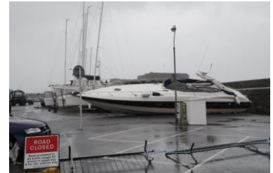
Severe storm battered east coast

A severe storm battered Guernsey's east coast, with wind speeds reaching Storm Force 10. Parked cars floated from their spaces as flooding caused the closure of most of the coast road, between Bulwer Avenue and the Val des Terres. Police officers and Civil Protection volunteers braved the horrendous weather to support the public.