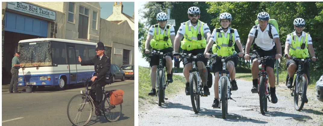
Police Cycle Team then and now

The Police Cycle Team increased to seven in 2014 allowing officers to help keep the public safe and provide closer working within the community.