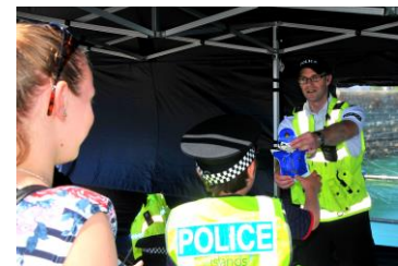
Officers at 'Sea Front Sunday'

Neighbourhood and Cycle Team officers took part, with other emergency services, in a traffic-related Seafront Sunday where children and young people met officers and got involved in 'Keeping Safe' on Guernsey roads.