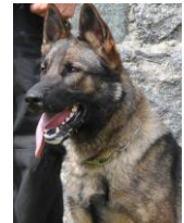
Police dog 'Ledi'

The recruitment of the police dog 'Ledi' in June brought the total number of animals in the section up to five, comprising of three general purpose dogs and two drug detection dogs.