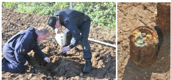
EOD officers safely dispose of mines found in Sark

Explosive Ordnance Disposal officers from Guernsey travelled to Sark to investigate a report of what was believed to be a number of Second World War mines ploughed up in a field. The officers carefully excavated the site and recovered a large quantity of 'S' mines. A total of 79 mines were recovered, 27 of which were thought to be live. Due to the volatile nature of the explosives, the mines needed to be handled with extreme care. The mines were safely disposed of by controlled explosion. The officers were assisted throughout by the Sark Constable and Vingtenier. This demonstrated the excellent co-operation between Guernsey and Sark Constables.