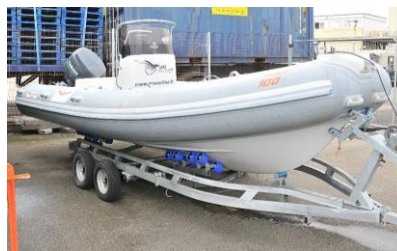
Rib used in importation