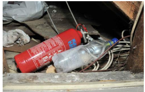
Methylamphetamine manufacturing site

A 35-year-old man and a 33-year-old female were subsequently charged with drug offences. The man was sentenced to nine years imprisonment and the female was sentenced to four years.