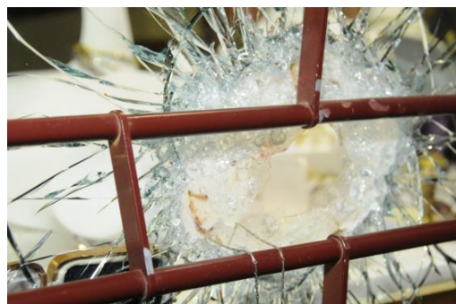
'Smash & grab' burglary

Over the Easter weekend a 'smash & grab' burglary occurred at a Town jewellers resulting in a substantial amount of high value jewellery being stolen. As a result of an extensive investigation a total of six individuals were arrested. A 'person of interest', who it is known fled to Europe, is still sought in relation to this investigation. A small amount of the stolen property was recovered from a 44-year-old local man, who was charged with related offences.